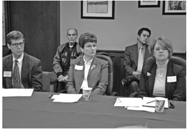
Chamber members at breakfast